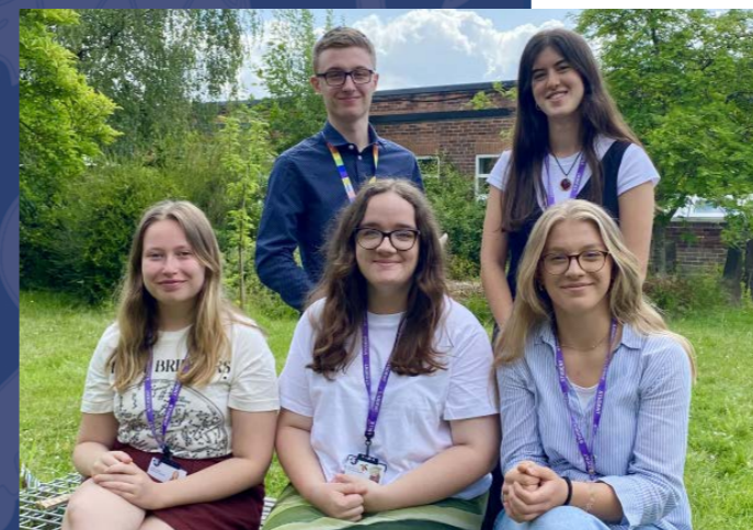
Sixth Form Student Leadership Team 2023-24