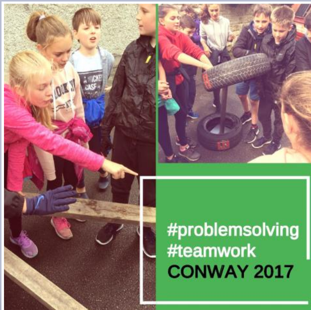
#problemsolving #teamwork CONWAY 2017

AT ALMOST HALF NINE, WE WERE BUNDLED INTO CLASSROOMS FOR THE GREAT EGG-DROPI! I MAINLY FOCUSED ON HELPING MAKE THE PARACHUTE AND SCRUNCHING UP PAPER FOR CUSHIONING. UNLIKE WESTMINSTER AND GROSVENOR, WE WORKED AS ONE TEAM. LUCKILY OUR EGG SURVIVED THE FALL. AS I AM WRITING, WE ARE ABOUT TO HAVE LUNCH. I AM SURE THAT, YET AGAIN, I WILL LOVE THE COACH TRIP BACK TO QPHS! IT WILL BE WEIRD AT SCHOOL IN MY OWN CLOTHES. BYE BYE, MENAI!