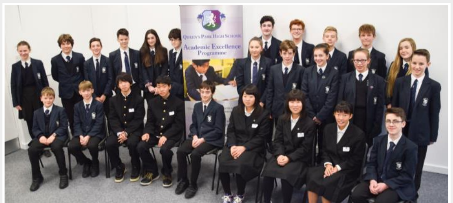
Japanese visitors working in partnership with our AEP students